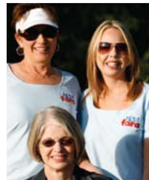
The Lonestar Benefit Bash 2008 was created by Partners of the Year winners Performance Award Center and Med-Pharmex.