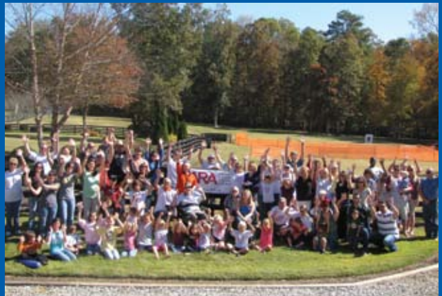
Great crowd at the Swing Away at FA Wiffle Ball Tournament and Family Fun Day in Cumming, Georgia.